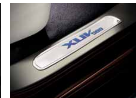
ILLUMINATED SCUFF PLATES