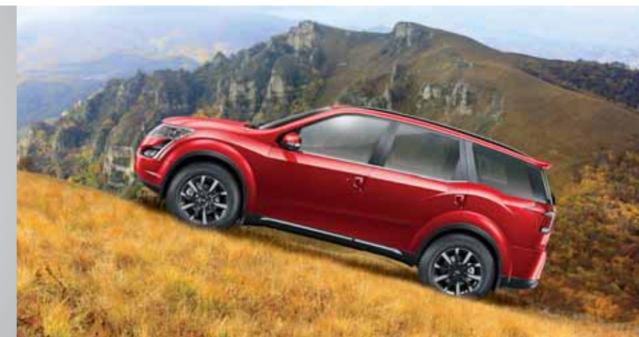
HILL DESCENT & HILL HOLD CONTROL