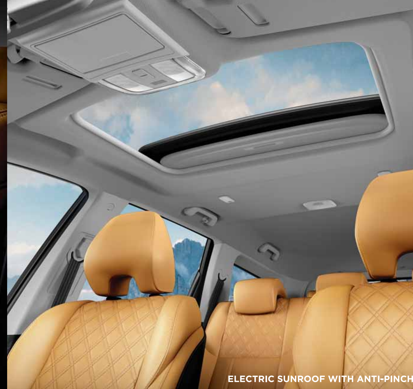
ELECTRIC SUNROOF WITH ANTI-PINCH

Step inside the new XUV500 and you can't help but feel pampered. The immaculate, soft-touch leather craftsmanship with fine stitch lines and piano black centre console add a dash of elegance to the dashboard. And the quilted, tan leather seats further accentuate this feeling of sophistication. But that's not all, look up and you will find the stunning electric sunroof with anti-pinch. Finally, the reduced noise levels, resulting in a much quieter in-cabin experience, ensures that even the most remote adventures, feel nothing short of 5-star extravagance.