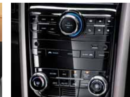
PIANO BLACK CENTRE CONSOLE