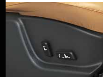
6-WAY POWER-ADJUSTABLE DRIVER'S SEAT

LUXURIOUS, SOFT-TOUCH, LEATHER DASHBOARD The dashboard and door trims have been fashioned with soft-touch, faux leather with fine stitch lines, elevating the interior's fit and finish by a few notches.