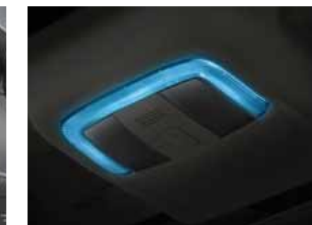
ICY-BLUE LOUNGE LIGHTING