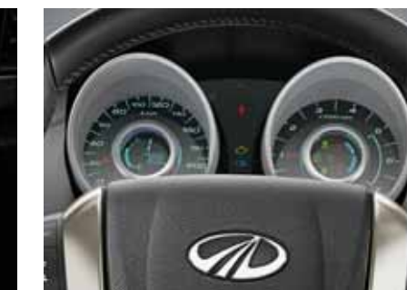
SPORTY TWIN POD CLUSTER