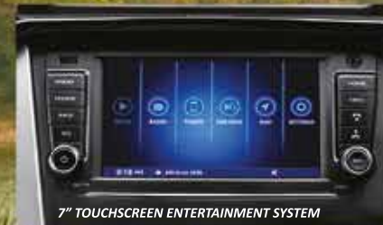
7" TOUCHSCREEN ENTERTAINMENT SYSTEM