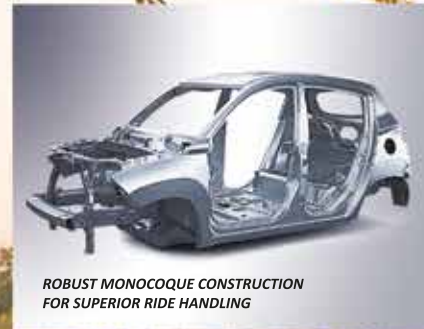
ROBUST MONOCOQUE CONSTRUCTION FOR SUPERIOR RIDE HANDLING

From balmy drives to offbeat destinations – the all new KUV100Nxt helps you take the roads less travelled, transforming your regular driving experience into pure thrill. Be free with the KUV100Nxt, and celebrate your true self with limitless exploration.